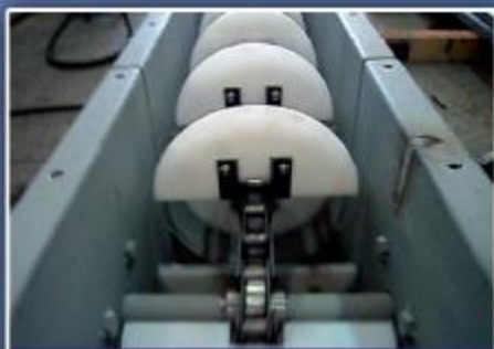
CHAIN WITH PADDLE ATTACHMENTS