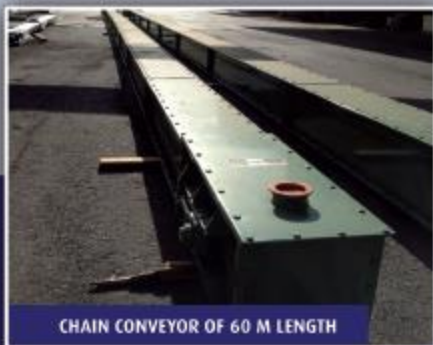
CHAIN CONVEYOR OF 60 M LENGTH