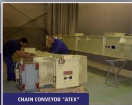
CHAIN CONVEYOR "ATEX"