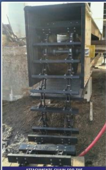
ATTACHMENTS CHAIN FOR THE TRANSPORT OF BIOMASS