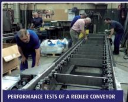
PERFORMANCE TESTS OF A REDLER CONVEYOR