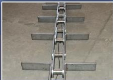
CHAIN WITH 90 DEGREES ATTACHMENTS