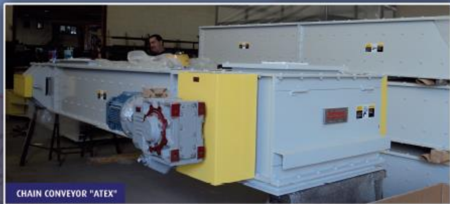
CHAIN CONVEYOR "ATEX"

MANUFACTURERS OF CHAIN CONVEYORS SUITABLE TO WORK IN EXPLOSIVE ATMOSPHERES (GAS CLASS 0, 1, 2? AND DUST CLASS 20) ALL MACHINES ARE ATEX CERTIFIED