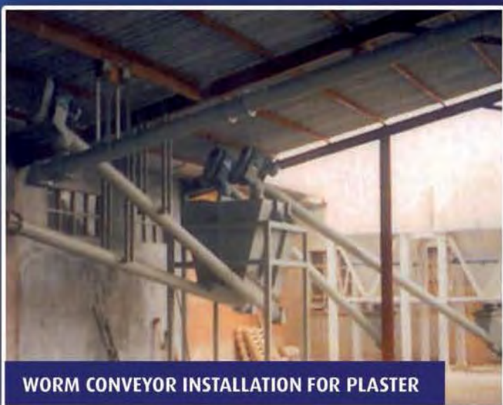
WORM CONVEYOR INSTALLATION FOR PLASTER