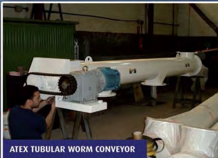
ATEX TUBULAR WORM CONVEYOR

WE MANUFACTURE TUBULAR WORM CONVEYOR SUITABLE FOR WORKING IN POTENTIALLY EXPLOSIVE ATMOSPHERES (POWDER/GAS) WITH ATEX CERTIFICATES