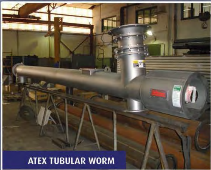
ATEX TUBULAR WORM