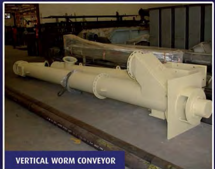
VERTICAL WORM CONVEYOR