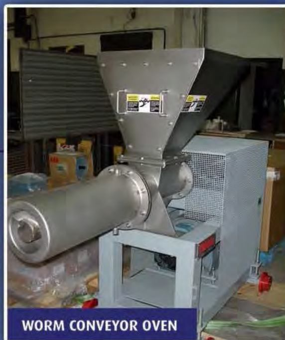
WORM CONVEYOR OVEN

MACHINERY MANUFACTURERS WITH CE MARKING IN COMPLIANCE WITH MACHINERY DIRECTIVE 2006/42/CE