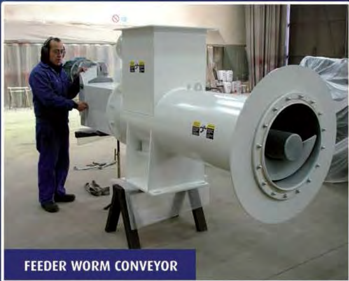
FEEDER WORM CONVEYOR