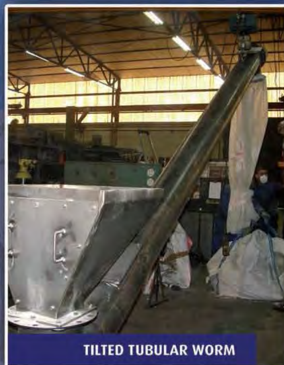
TILTED TUBULAR WORM